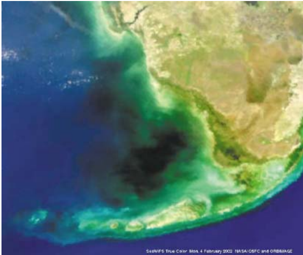
Figure 2: The "Black Water Event" (February, 2002 satellite image) off the west coast of Florida showing the effects of land-based sources of pollution moving into the FKNMS (Naples Daily News, 2002; SWFDOG, 2002). The Mississippi and Atchafalaya Rivers drain 40% of the United States and parts of Canada (USEPA, 1994) providing 79% of the Gulf of Mexico freshwater inflow. Nutrient loadings in the Gulf of Mexico have risen dramatically over the last 30 years due to increasing agricultural, commercial, and residential development and are causing growing eutrophication problems (Day et al., 1995) and an ever increasing Gulf of Mexico dead zone (MPB News, 2001). The largest continuous input of nutrients to south Florida coastal waters comes from the west Florida shelf and its adjacent rivers (Lee et al., 2002).