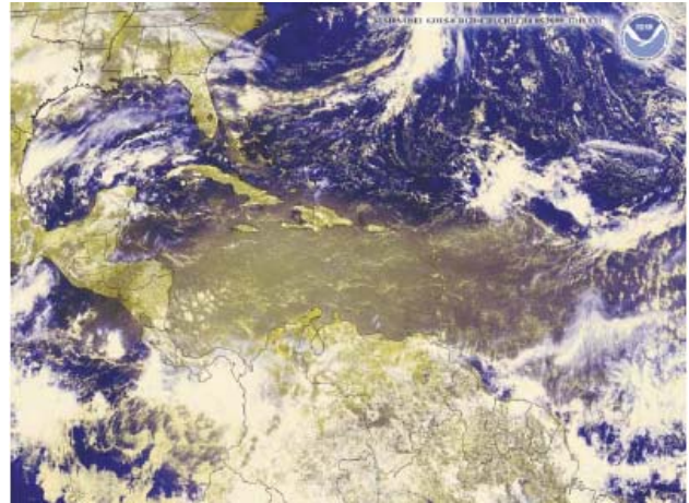
Figure 1: Airborne African dust (brown haze) over the Caribbean Sea and western Atlantic Ocean. Dust originated in the Sahara Desert where it was lifted and carried off the coast by strong winds. Prevailing winds carry African dust into the FKNMS primarily during June - October. Since the late 1960s, droughts and agricultural practices have increased the size of arid lands in North Africa and fueled the problem (from Griffin et al. , 2002).

Cuba and the Caribbean : south Florida coastal waters are also linked via currents to waters of the north coast of Cuba and the Caribbean but the potential impact of pollution from these areas needs study.